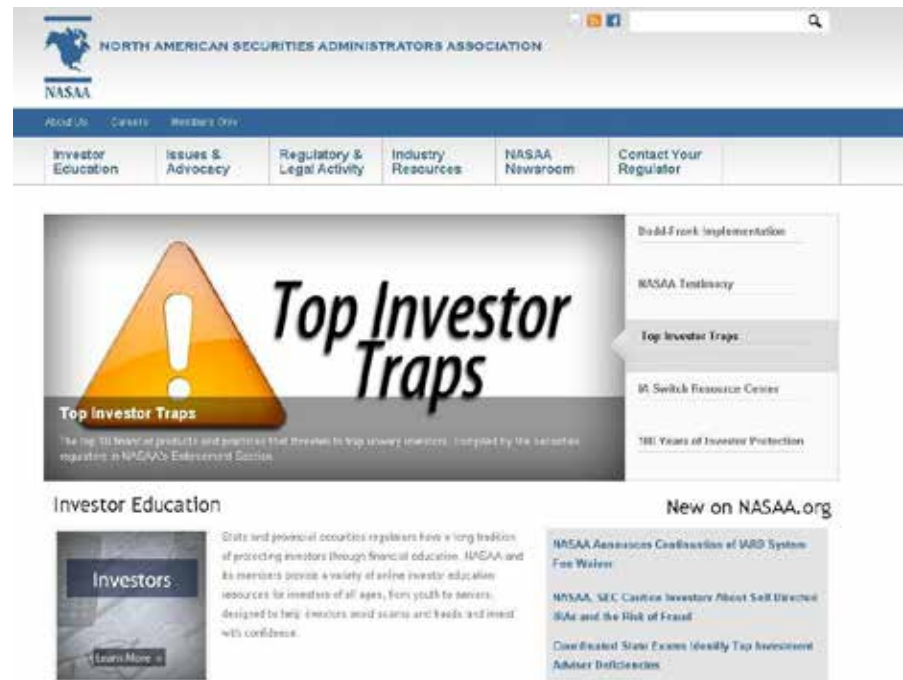
New NASAA website

The new website remains located at www.nasaa.org and continues to provide resources and information for investors, industry professionals, policymakers and regulators.