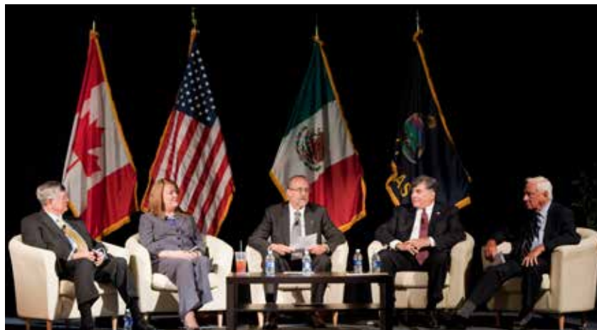
The second panel at NASAA's annual conference in Kansas brought together distinguished NASAA veterans and alumni to reflect on the evolution of state securities regulation.

The conference featured three panel discussions to honor NASAA members' long history of investor protection, examine the current state of financial services regulation and explore what lies ahead for investors, industry and regulators.