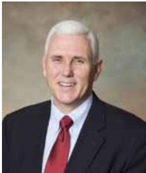
The Honorable Mike Pence Indiana Governor

12 p.m. - 1:30 p.m. Grand Ballroom 4 Keynote Luncheon