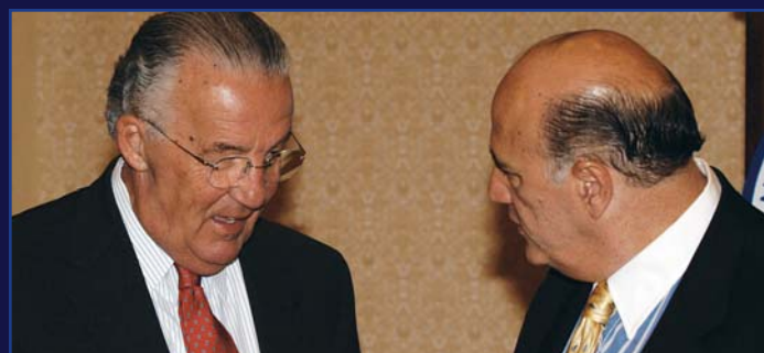
NASAA President Ralph A. Lambiase (CT) welcomes Sen. Paul Sarbanes (D-MD), Ranking Member of the Senate Banking Committee, to NASAA's 2004 Spring Conference.

Sen. Paul Sarbanes (D-MD) Ranking Member Senate Banking Committee