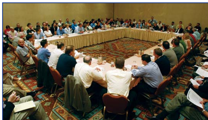
The Enforcement Section Forum at the 2004 NASAA Annual Conference attracted a large audience of NASAA Members and industry representatives.