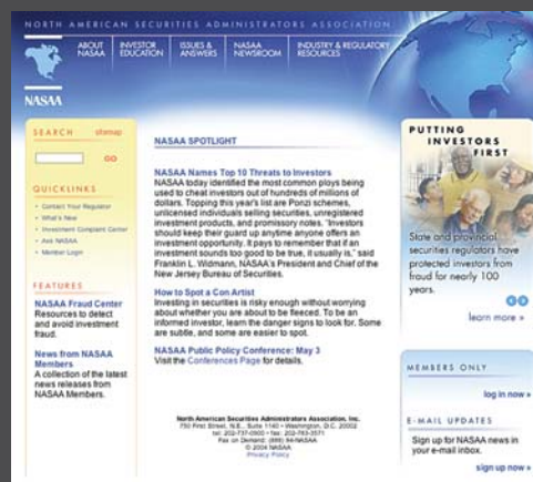
NASAA's newly redesigned and enhanced website offers users more resources and improved navigation.

The Committee also oversaw the redesign of the NASAA website ( www.nasaa.org ) and the development and distribution of NASAA's advocacy brochure, Putting Investors First.