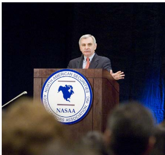
U.S. Senator Jack Reed (D-RI) outlines the need for regulatory reform in a speech at the 2008 NASAA Public Policy Conference.

"As part of our economic recovery package, what you will see coming out of my