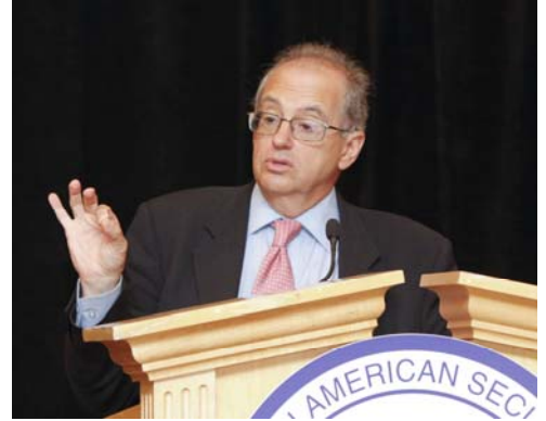
Noted political commentator Norman Ornstein offers an entertaining and insightful outlook for the upcoming presidential and congressional elections.