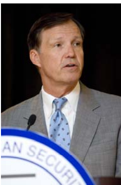
In his final address at a NASAA conference, former SEC Chairman Christopher Cox tells NASAA: "There's nowhere that our joint collaboration with our state regulatory partners is more important than in our daily battle to combat fraud. We could not do our jobs at the SEC without you. We're proud to be your partners."