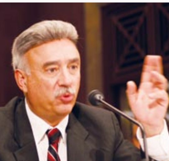
NASAA President Joseph Borg makes a point in testimony before the U.S. Special Committee on Aging.

In July 11, 2007 testimony, NASAA told a Congressional panel that allowing public offerings of private equity and hedge fund management firms without appropriate regulatory protections puts retail investors at risk. “Due to a lack of transparency, the level of individual and systemic risk attached to these investments remains unknown to the individual investor. Their fee structures and lack of full disclosure obscure real returns. The structure of these new instruments places investors in a vulnerable position, subject to the whims of controlling persons and literally without recourse. In light of the complexity and uncertainty surrounding these instruments, allowing them to be offered to the public without appropriate regulatory protections poses serious risks to investors,” NASAA President Joseph Borg testified in a hearing examining possible risks presented to retail investors by the recent Blackstone Group L.P. and similar initial public offerings of the management entities of hedge funds and private equity funds.