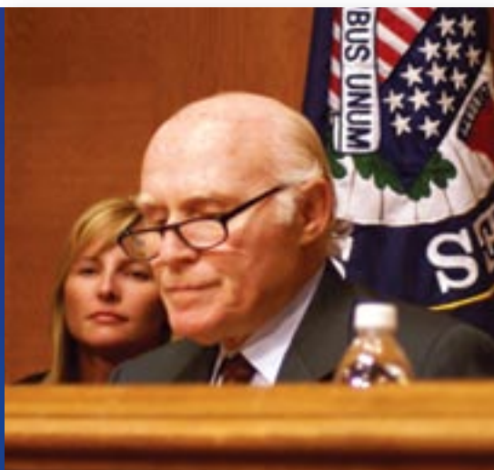
U.S. Senator Herb Kohl (D-WI), chairman of the Senate Special Committee on Aging, opens a hearing on senior investor protection.