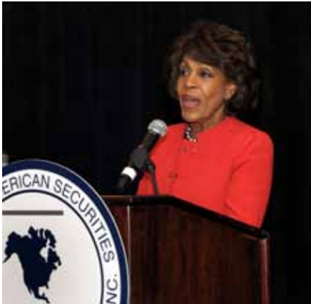
Rep. Maxine Waters (D-CA) delivering the keynote address outlining her legislation in support of user fees to help promote strong SEC oversight of investment advisers.