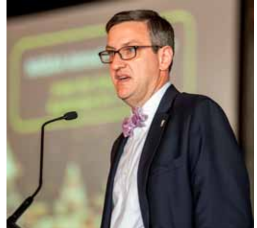
Arkansas Securities Commissioner A. Heath Abshure delivers the presidential address at NASAA's 2012 annual conference in Coronado, California. Abshure's one-year term runs through September 2013.